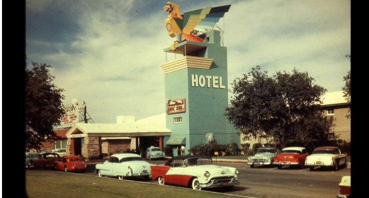
The old Las Vegas Thunderbird Hotel, where the LVRAC held its early meetings.

The popular and colorful “Thunderbird” sign at the hotel stuck with the club and has been its logo for more than a half century.